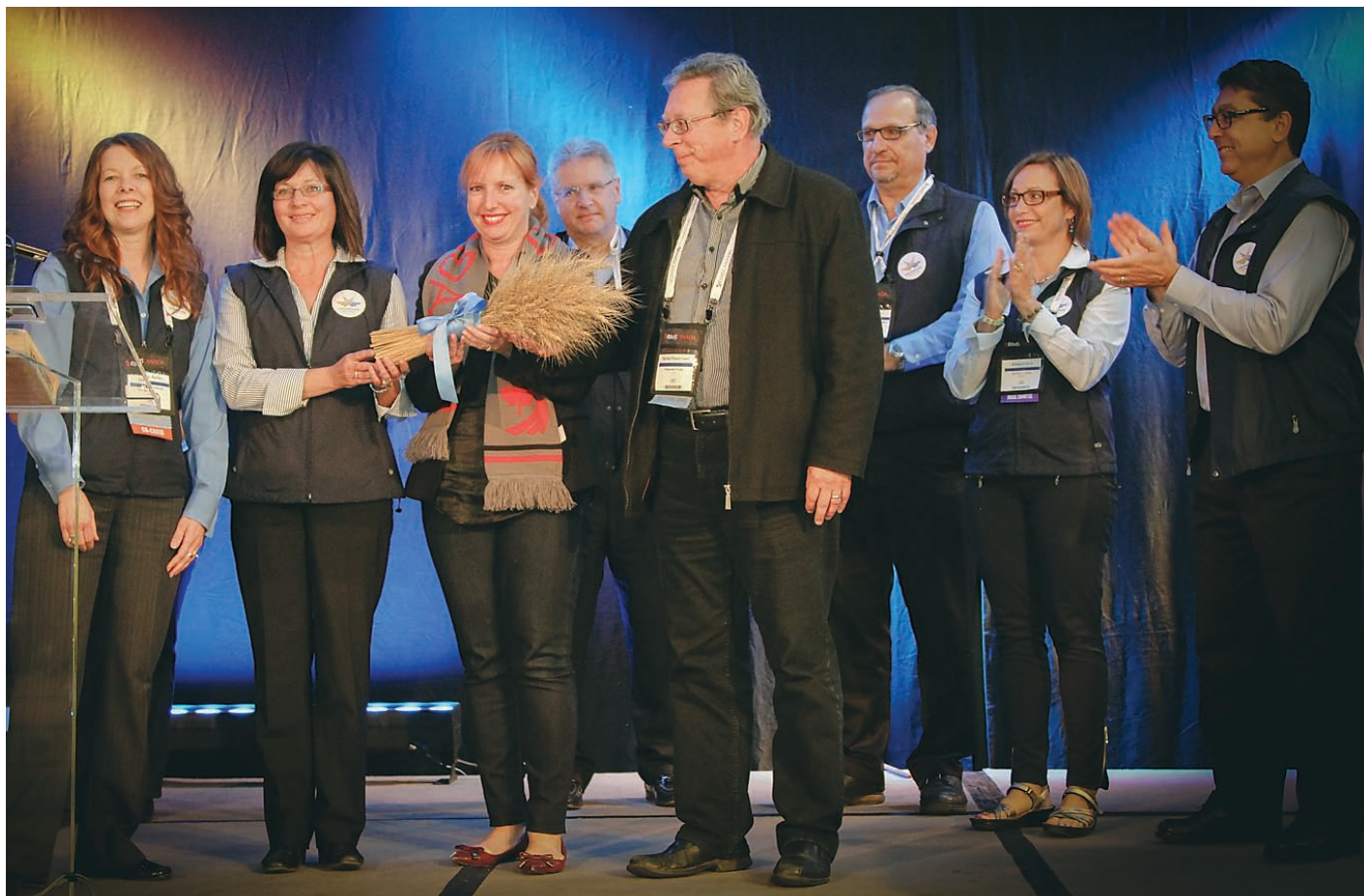
Manitoba Local Organizing Committee passes on wheat sheaf to Quebec City Local Organizing Committee.