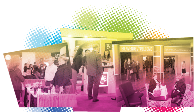
EXHIBIT HALL: The exhibit hall is a hub of activity—it's the central place to meet our industry partners, pick up a coffee, a few souvenirs, and maybe even a prize or two. Don't forget your business cards and be sure to visit the RIMS Canada booth to tell us how your conference is going. Exhibit hall hours are Sunday, Sept. 11 (12:30 pm-4 pm); Monday, Sept. 12 (9 am-5:30 pm); and, Tuesday, Sept. 13 (9 am-noon).