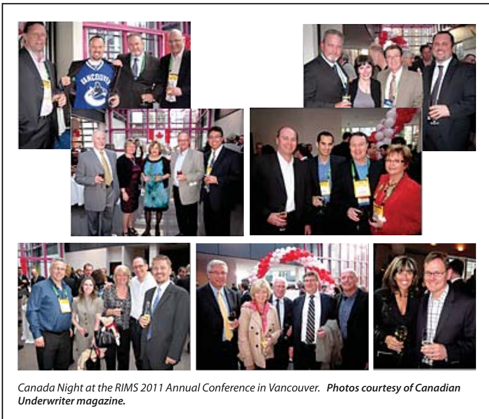
Canada Night at the RIMS 2011 Annual Conference in Vancouver.