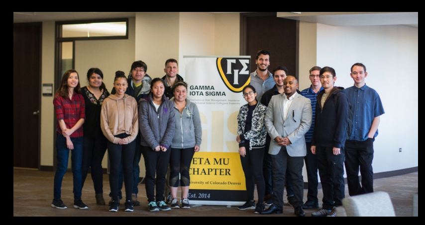
Gamma continues to grow as CU Denver RMI enrolment increases