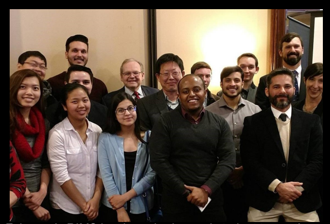
February's RIMS luncheon had record student turnout!