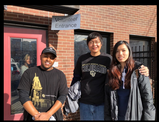
Fellow Gammas volunteer at the Denver Rescue Mission.